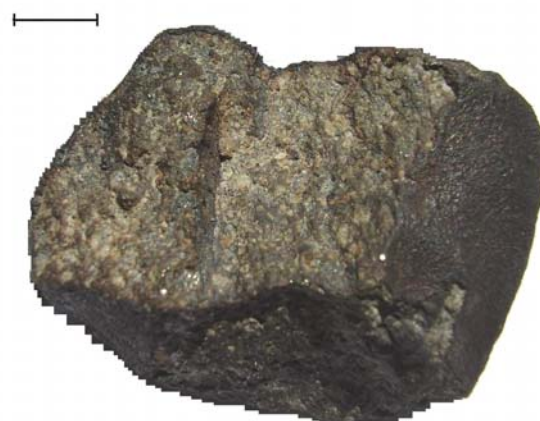
Fig. 1. The first recovered meteorite by J. García was a 76.6 g piece that exhibits fusion crust over about 40% of the samples surface. The scale in the upper left corner is 1 cm.

Methods: Natural and induced thermoluminescence properties were measured in two fragments of stone #6 using apparatus and techniques described in earlier publications (e.g., [3]). The bulk composition of Cali was determined on two samples from an ~1.2 g fragment of the interior of stone #6 by wet chemical methods [4]. Two independent methods were used for sample preparation, (1) an acid digestion treatment in a sealed Teflon reactor; and (2) alkaline fusion in a zirconium crucible. Analyses were performed by means of inductively coupled plasma mass spectrometry (ICP-MS) and inductively coupled plasma optical emission spectroscopy (ICP-OES).