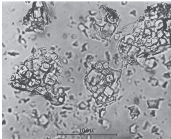
Fig. 4. Fragments (immersed in oil) from the Allende meteorite, showing octohedra of spinel embedded in a Ca,Al-rich glass. (Refractive index 1.646). (Marvin et al., 1970).