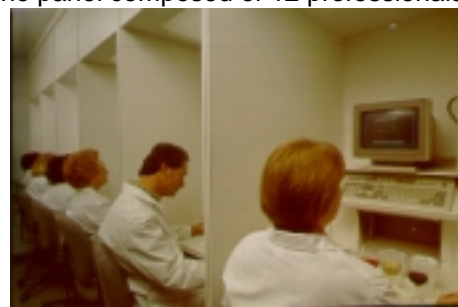
Trained panelists evaluating sensory characteristics of processed foods

The University of Arkansas Rheology and Sensory Research Program encompasses research evaluating the effects of animal and food processes on food quality. The program is organized in three interactive research areas: