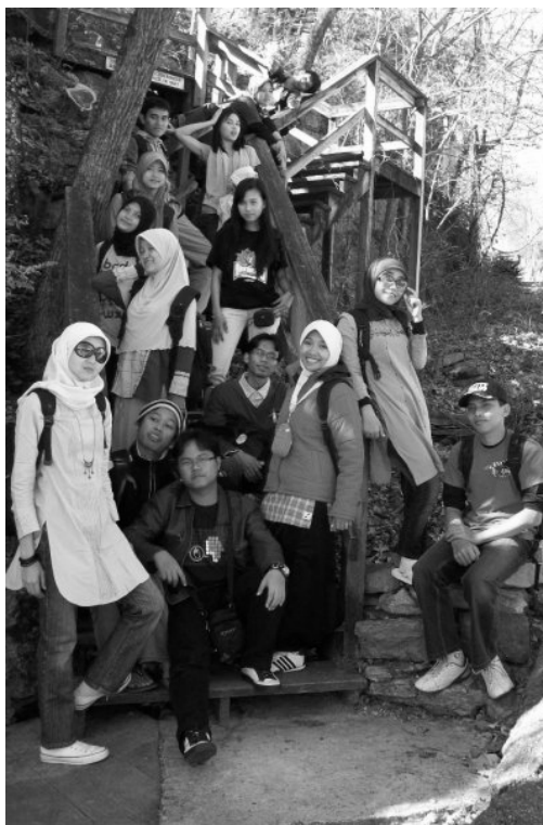
SILC IELSP Students on a recent trip to Eureka Springs

Coming to the United States really changed my life, I've found many new things and I am encouraged to live better because I've seen a better life here than in my country. I promise to reach my aspiration to change my life.