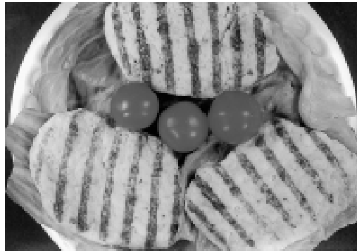
Not visible to the eye: Poultry coated with protective bacteriocins.

Johnson used a chicken breast with Listeria monocytogenes on it as an example. Processors put the zein film containing nisin on the breast. "The nisin molecule is within the film just