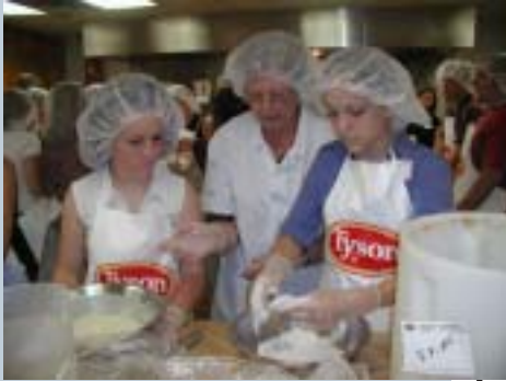
WORKING FOR THEIR SUPPER - Students are shown in the Tyson R & D Kitchen breadng tenders they'll eat later for their own lunch.