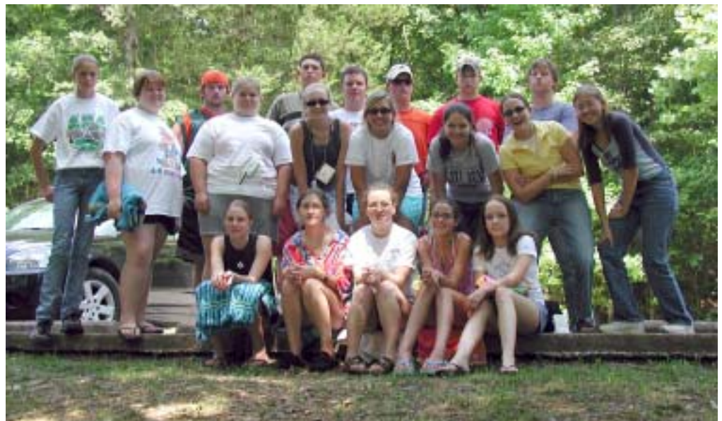
ARKANSAS YOUTH - Students attending the Poultry Science Youth Conference stop to pose at Devil's Den State Park. Students were involved in lectures, hands-on projects, and recreational activities. All projects were designed to expose them to the University of Arkansas campus and the Department of Poultry Science.

Sponsors of the conference were the Farm Bureau, Harold E. Ford Foundation and the Center of Excellence for Poultry Science.