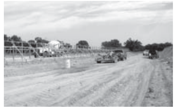
UNDERWAY - Construction has started on the new facility Cobb-Vantress is financing for the U of A.