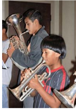
Members of the Energetic and Outstanding Brass Band from Ecuador

Website: www.uark.edu/misc/partners/news.html BLOG: partners-intercom.blogspot.com