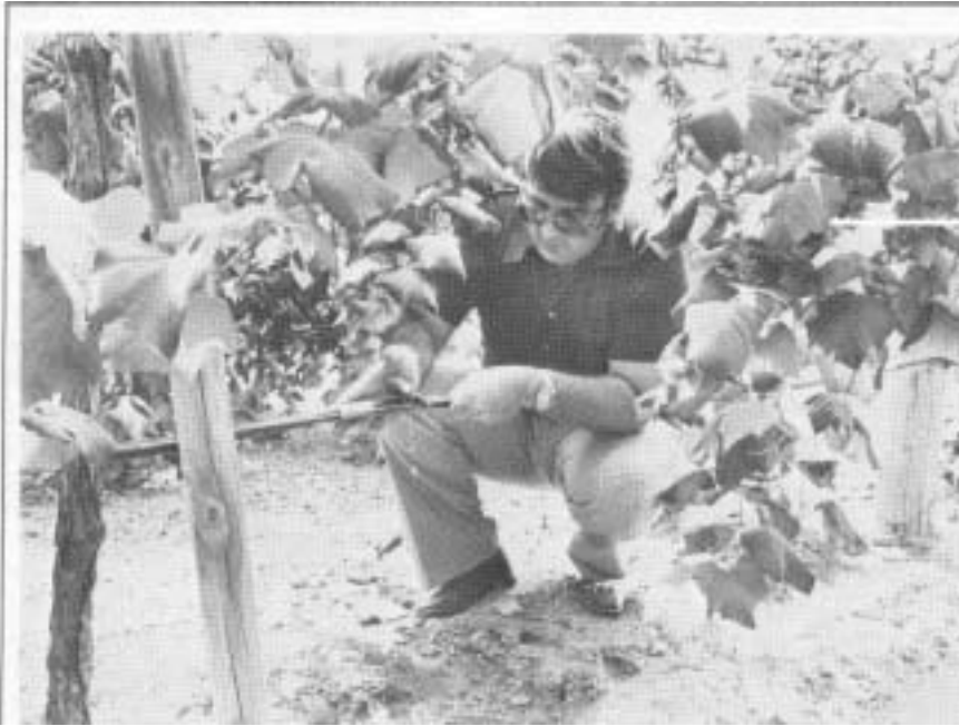
The drip irrigation system in the University of Arkansas Experimental vineyard was attached to a wire located approximately 18 inches above the ground. Locating the PVC line and emitters at this height does not interfere with mechanical harvesting, weed control or grape hoeing for control of root borer.

systems. The salt accumulation is leached to the edge of the wetted value) of the juice. Juice acidity was not affected by irrigation by the final harvest (See Table).